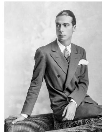
Cristóbal Balenciaga, 1927

While confirming the unique spirit and style, as well as the legend of Cristóbal Balenciaga, these films also reveal some of the intimacy of the presentations at the time in the House's couture salons.