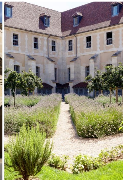
40, rue de Sèvres

For its 3rd participation, Kering will present the historical background of the former Laennec Hospital to the public to raise awareness of the importance of heritage preservation and its enhancement.