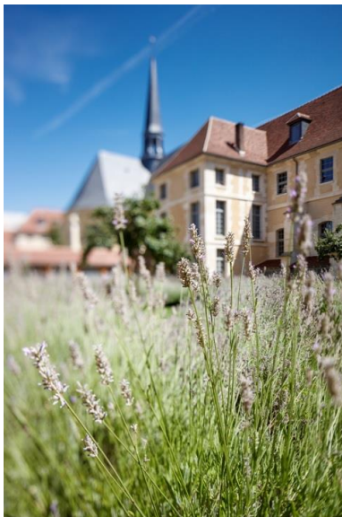
40, rue de Sèvres

40, rue de Sèvres is a place with an exceptional heritage and serves as the headquarters of Kering and Balenciaga. It will open its doors to the public on Saturday 15 and Sunday 16 September 2018, for the 35th edition of the European Heritage Days. For the very first time, the public will also be able to admire the Héloïse and Abélard reliquary chest.