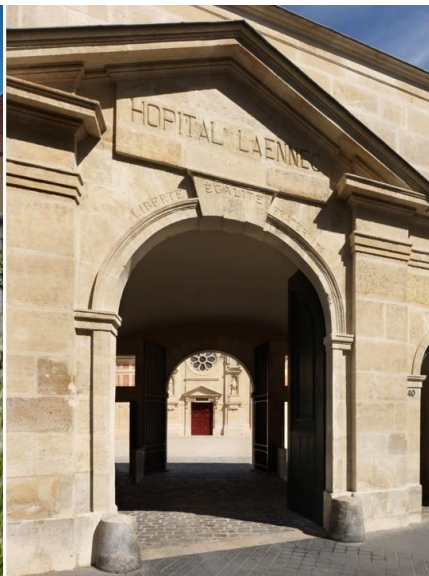
40, rue de Sèvres