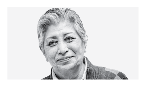
Las Panas - Mexico Teaching breadmaking to empower against violence

35 low-income women served for free, with services including workshops, psychological support and connecting them to jobs in bakeries in 2021