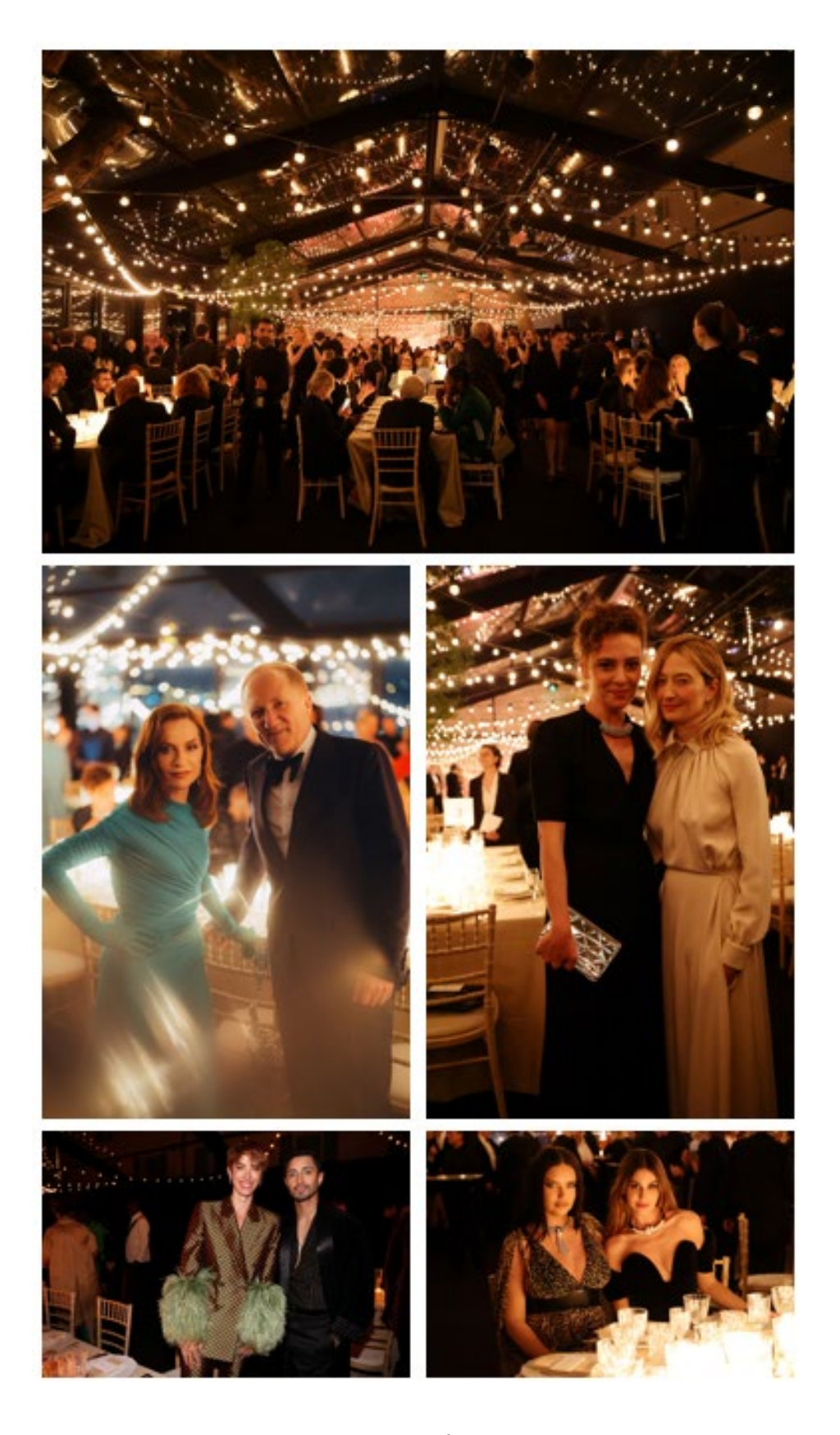
Download the visuals of the dinner \underline{\text{here}} .